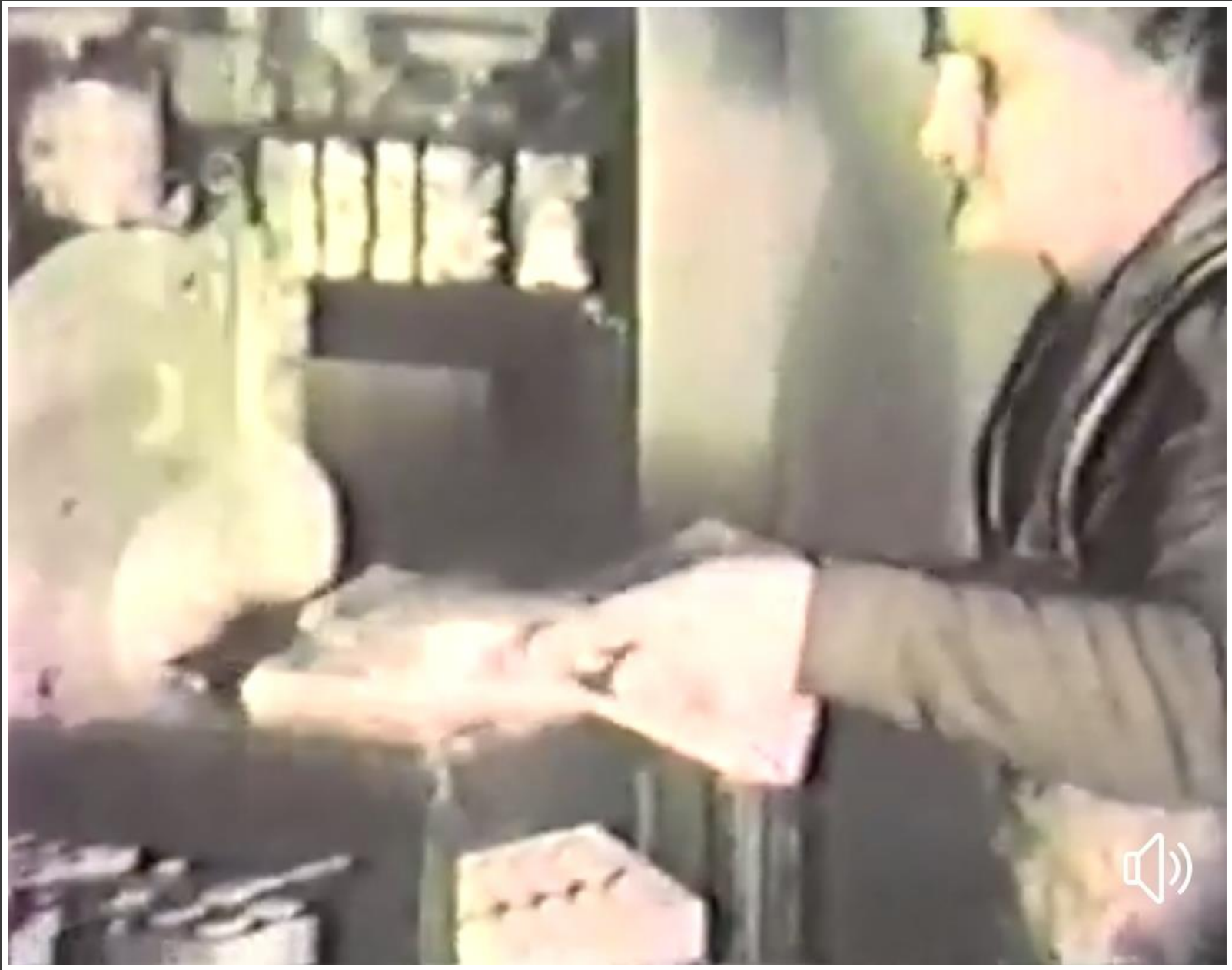
Village Store, near Bay Settlement Submitted by Liz Bell